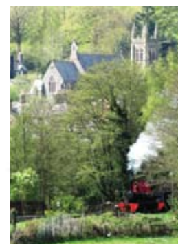
Pen y Mount

Ask the Guard or at the Shop about joining us.