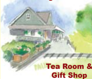
Tea Room & Gift Shop